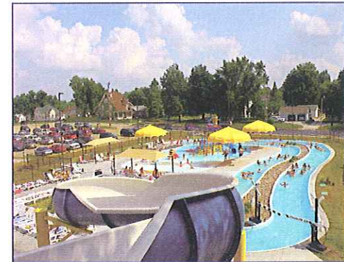
Relax in the Lazy River

BEACH BASH: Thank you . . . thank you . . . thank you . . . for your support of the new Maring Aquatic Center. As our special guests you'll enjoy an evening of beach games, beach music & prizes. Price: Free for season pass holders, guests $3. Dates: August 5th 7:45-10 p.m.