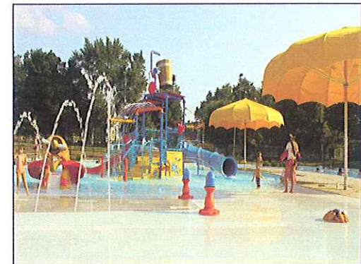
Spray Features Will Cool You Off on a Hot Day!